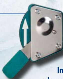
Internal release 47 HP