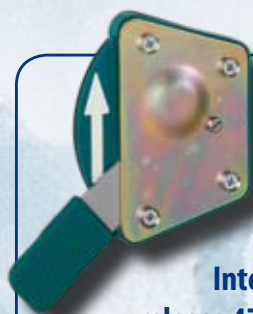
Internal release 47 STD