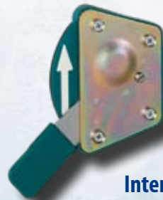
Internal release 47 STD