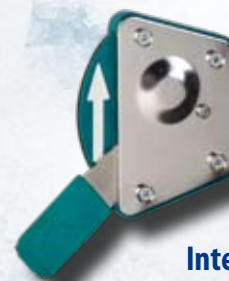
Internal release 47 HP